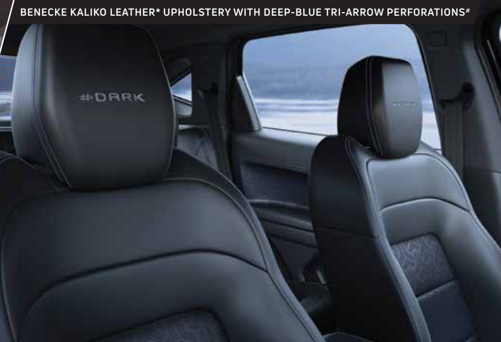
BENECKE KALIKO LEATHER* UPHOLSTERY WITH DEEP-BLUE TRI-ARROW PERFORATIONS*