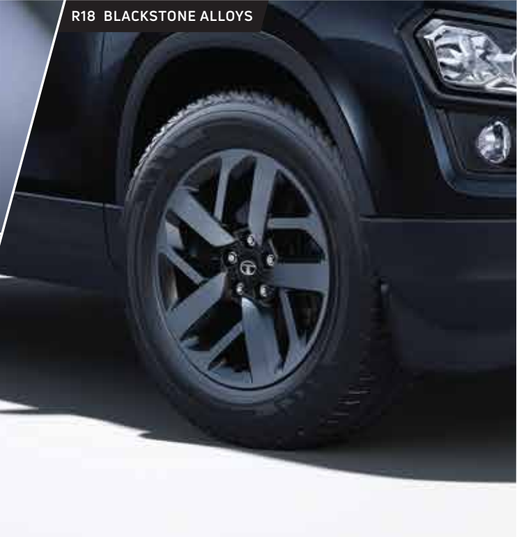
R18 BLACKSTONE ALLOYS