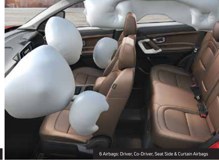
6 Airbags: Driver, Co-Driver, Seat Side & Curtain Airbags