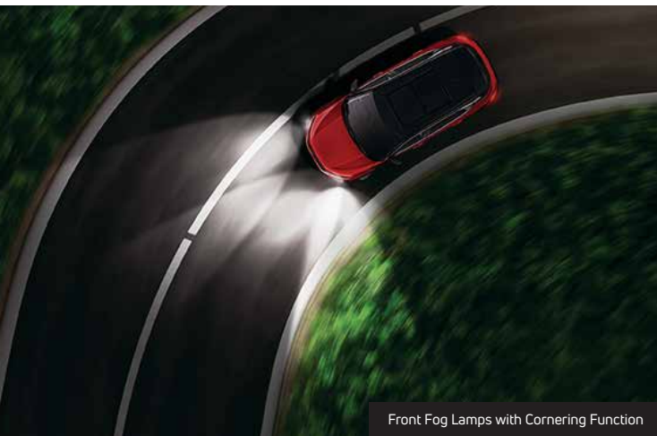
Front Fog Lamps with Cornering Function