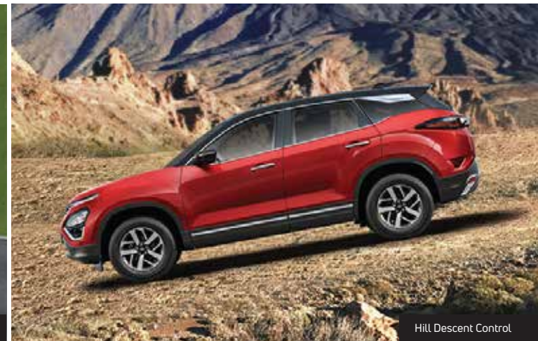
Hill Descent Control