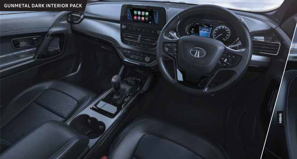
GUNMETAL DARK INTERIOR PACK