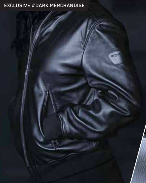
EXCLUSIVE #DARK MERCHANDISE