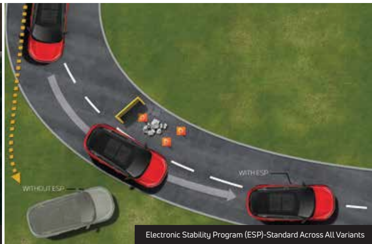
Electronic Stability Program (ESP)-Standard Across All Variants