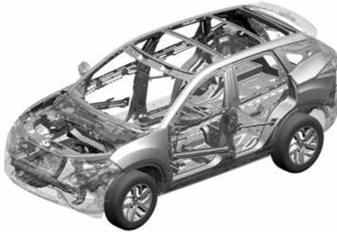
Efficiently Designed Crumple Zones