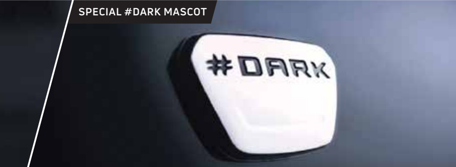
SPECIAL #DARK MASCOT