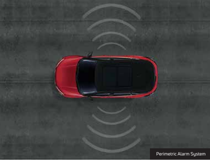
Perimetric Alarm System